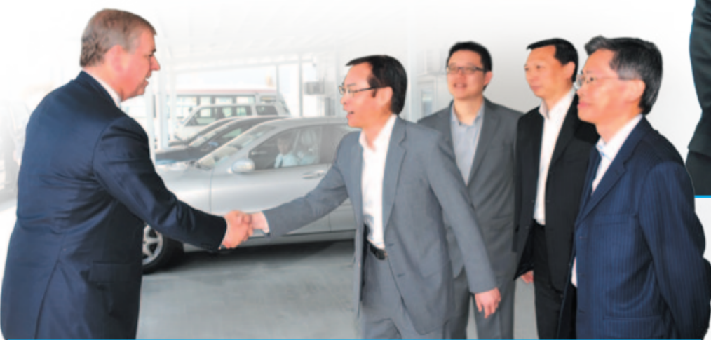
約克公爵安德魯王子蒞臨啟德 Prince Andrew, the Duke of York paid a visit to KTD