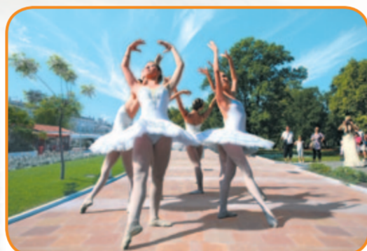
觀賞平台 Viewing Platform

reprovisioning of Radar on top of the cruise terminal building. Coming next will be the Kai Tak Nullah modification works, which are planned to start in the first quarter of 2013.