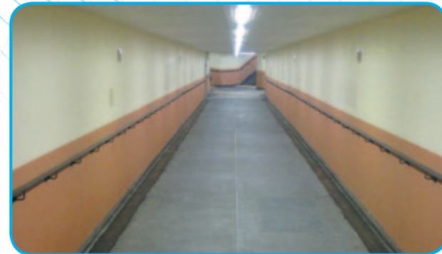
有待優化的行人隧道 Subway to be enhanced

The connectivity of Kai Tak will be further enhanced, which is not only beneficial to its development intensity and diversity, but also helps energise the whole of Kowloon East. KTD, together with the 168 hectares of