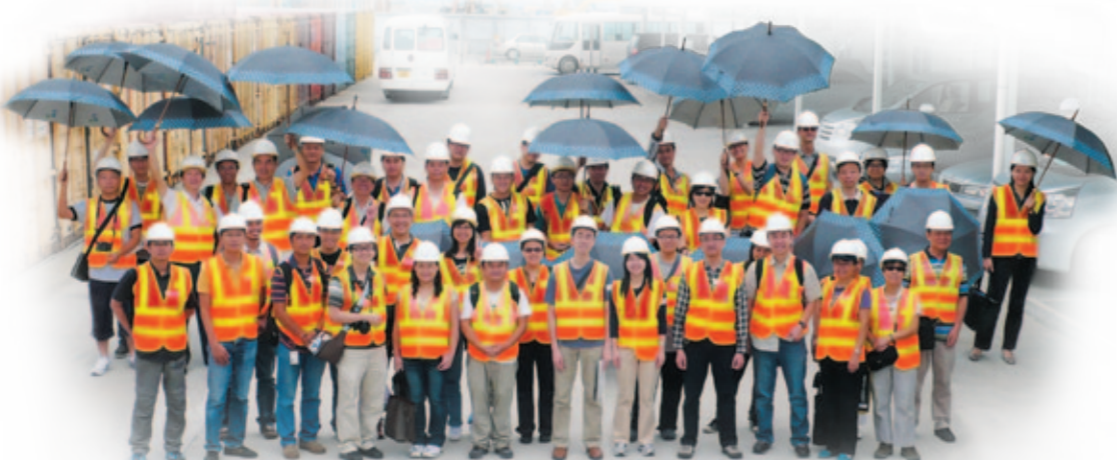
「啟德之友」一周年活動 1st Anniversary Activity of "Friends of Kai Tak"

另外，早前於9月24日，一眾「啟德之友」會員參加了該會成立一周年的活動，一同參觀啟德發展區。眾會員表現得十分雀躍，並期望再次參與日後的活動。「啟德之友」是由啟德辦事處成立，目的是要促進公眾與社區的相互溝通。