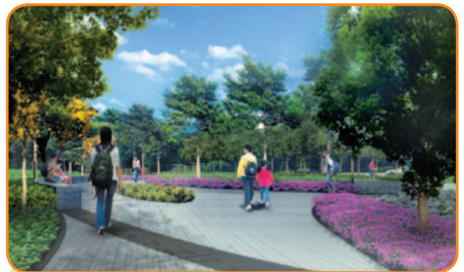
美化市容地帶構想圖 Artist impression of amenity area

為了確保啟德發展區四通八達、綠意盎然、以人為本，讓香港市民享受美好的成果並引以自豪，各方所付出的努力有目共睹。憑藉完善而周詳的規劃，此目標應指日可達。□