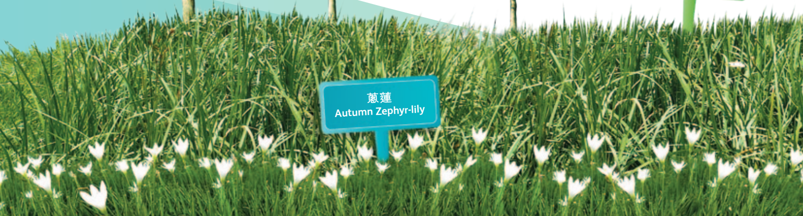
蔥蓮 Autumn Zephyr-lily