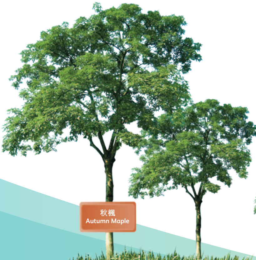
秋楓 Autumn Maple