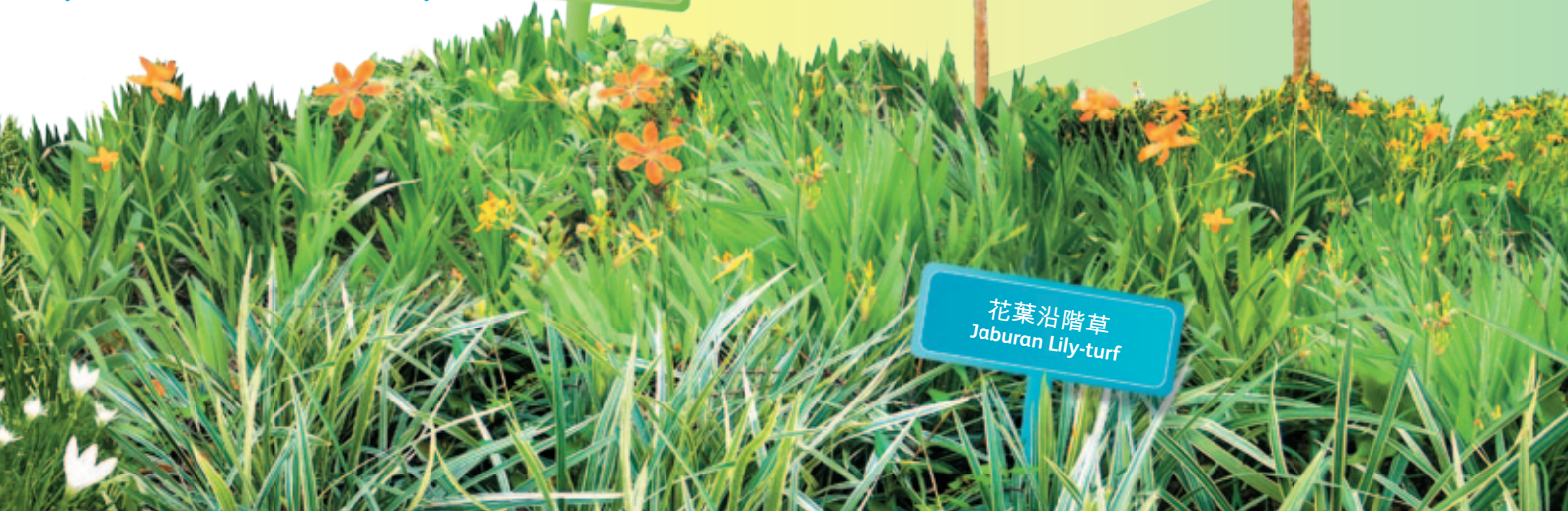
花葉沿階草 Jaburan Lily-turf